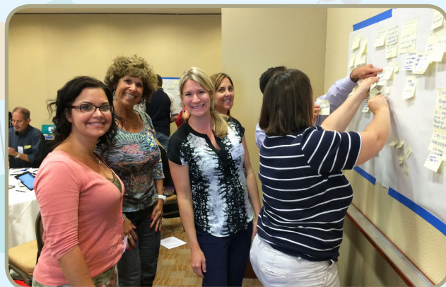
Science educators participating in the NGSS Rollout #1 in Long Beach, May 2014.

CSTA members wrote, presented, and co-sponsored the statewide NGSS Awareness Phase Rollout #1. This 2-day professional learning event was presented three times around the state in 2013-2014. Over 600 science educators participated in these three events made possible, in part, by the hundreds of hours contributed by CSTA members.